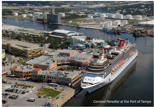
Carnival Paradise at the Port of Tampa

It may be argued that Florida's dominance in the cruise industry is largely related to its strategic positioning at the gateway to the Caribbean and the Bahamas, which continue to represent by far the most appealing destination for cruise vacationers, with the Caribbean at 43 percent and the Bahamas at 25 percent, tied with Alaska and well ahead of the next destination on