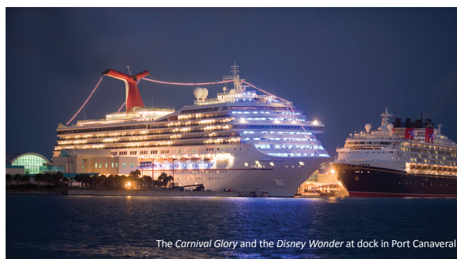
The Carnival Glory and the Disney Wonder at dock in Port Canaveral

To this end, consistent with the challenges and objectives expounded upon within the text of this