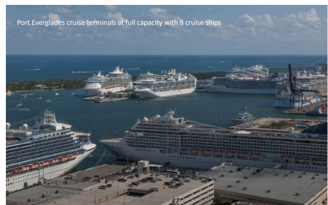
Port Everglades cruise terminals at full capacity with 8 cruise ships

On the water side, cruise ships approaching from the Atlantic Ocean enter PortMiami using a 500-foot-wide by 2.82-nautical-mile entrance channel through Outer Bar Cut, which is 44 feet deep and travels northwest